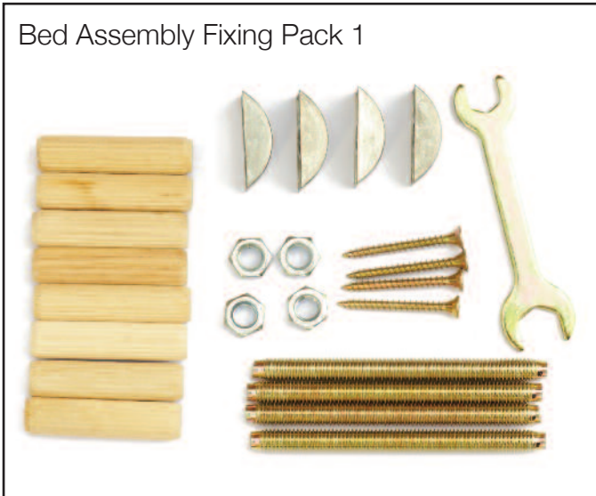
Bed Assembly Fixing Pack 1

Revival Beds are easy to build and only takes about 45 minutes to an hour assemble.