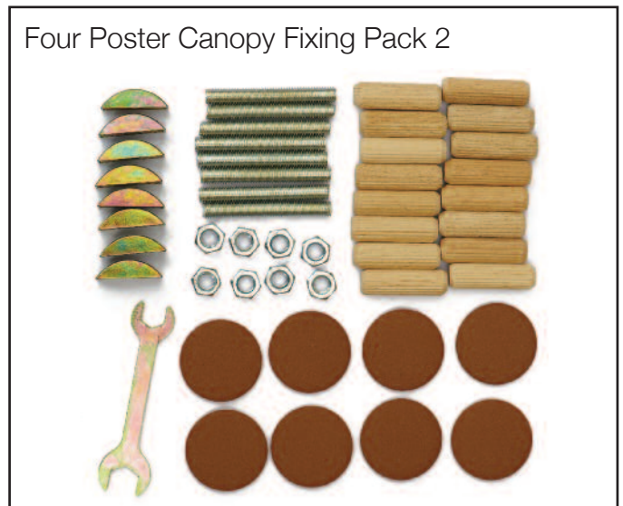
Four Poster Canopy Fixing Pack 2

The Four Poster Canopy Fixing Kit: 16 x dowels, 8 x threaded bar, 8 x half-moon washer, 8 x nuts, 8 caps and 1 x spanner. Use this pack to assemble the canopy of your four poster bed.