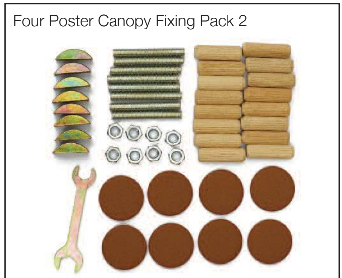
Four Poster Canopy Fixing Pack 2

The Four Poster Canopy Fixing Kit: 16 x dowels, 8 x threaded bar, 8 x half-moon washer, 8 x nuts, 8 caps and 1 x spanner. Use this pack to assemble the canopy of your four poster bed.