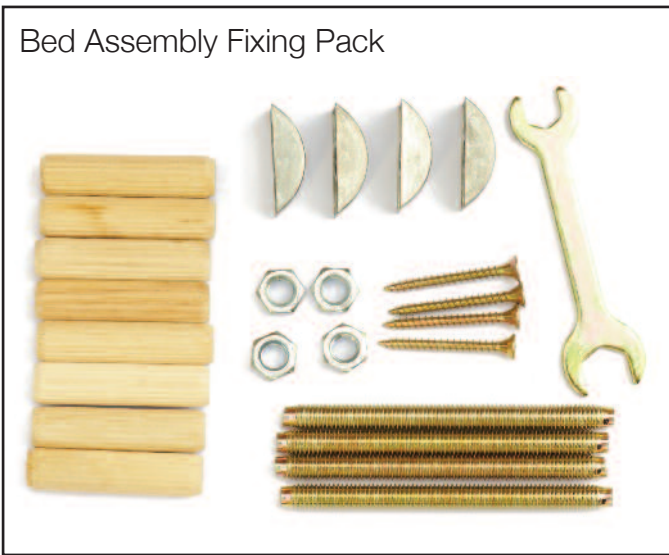
Bed Assembly Fixing Pack

Revival Beds are easy to build and only takes about half an hour to 45 minutes to assemble.